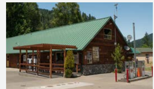
Still serving the community. Now, connected for the future.