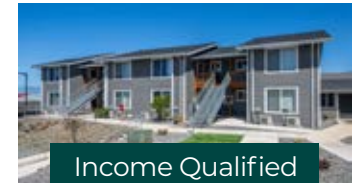
Income Qualified Improvements