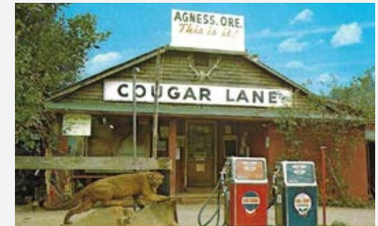
A gathering place for generations.